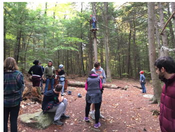
High ropes course!