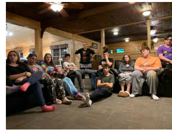
Kickin' back Tuftonboro style.