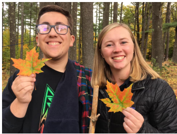
Fall foliage in the White Mountains!

Here are some great photos from last weekend's trip to Tuftonboro!