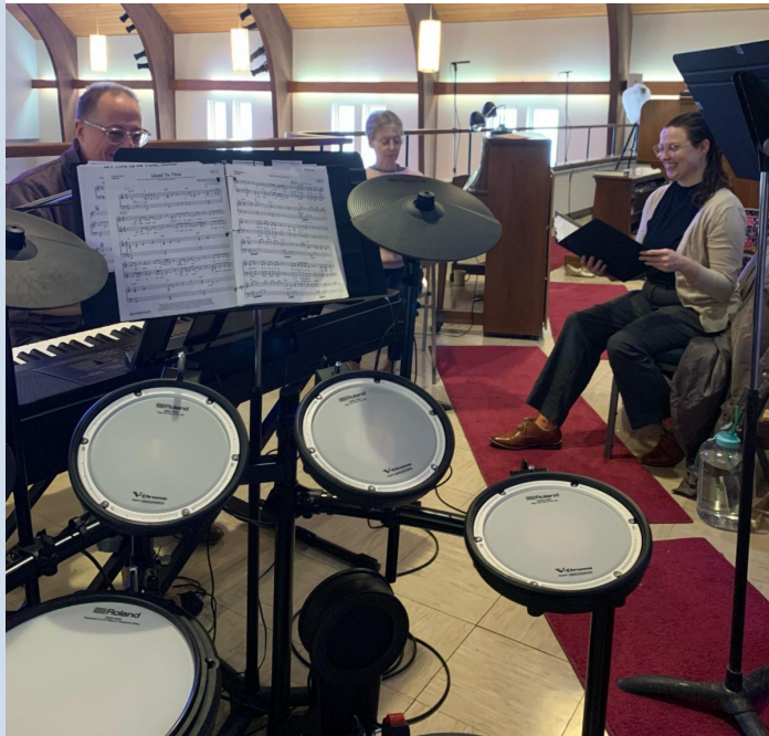
Worship Ensemble continues to rock out at rehearsals Sundays after Worship.