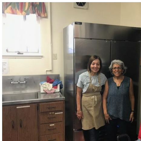
Two volunteers are pictured happily above in front of the new lunch program freezer.