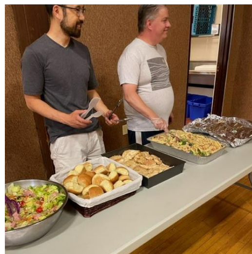
Here are volunteers in action serving a meal as part of our FBC Beverly meal programs.